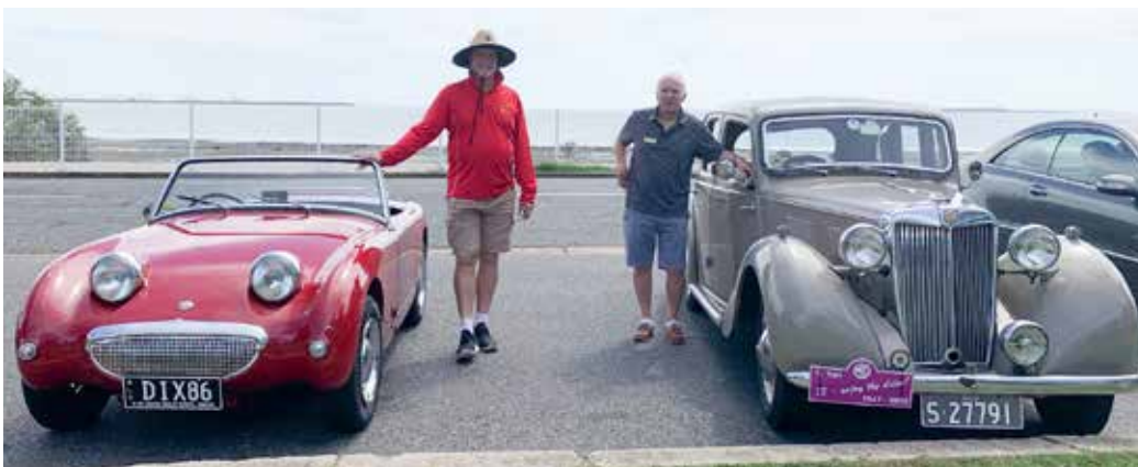
At the Wynnum Waterfront