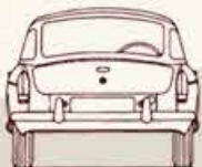
Renovo Soft Top Care Products